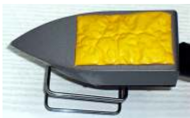
Fig. 3C Temperature test at approx 150° C