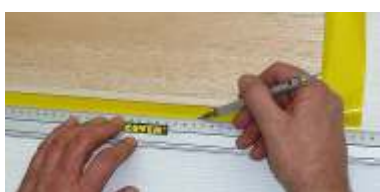
Fig. 10a Trim off surplus