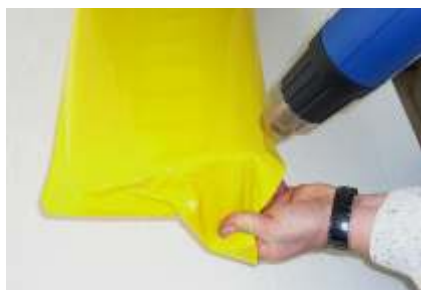
Fig. 11a-d Covering of the wing tip