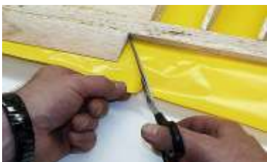
Fig. 12a For Inside corners, first slit 45° C.