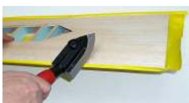
Fig. 10b Complete bonding