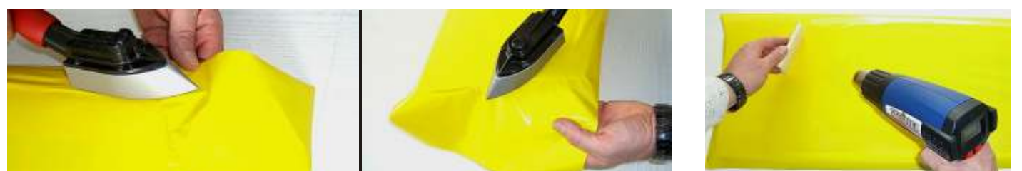
Fig. 9 / 9a Gradually work around curves

Set your covering iron to low (90° C) tacking the ORACOVER® from centre, as we did in Fig. 5 and 13. Tack the entire surface with low heat, then again repeat the same procedure with middle range (130° C) as in Step 8. Keep your iron flat to the surface so all of the ORACOVER® is tightly bonded to the surface. For the second and final shrinkage you can also use a paint-stripping gun, see step 9. In doing so the covering must be firmly pressed onto the surface with a soft cloth (or kitchen roll), or better still, with the ORACOVER® -felt blade (ref. no. 0915), see fig. 9a and 9b.