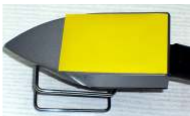
Fig. 3A Temperature test at approx. 90° C