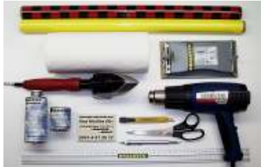
Fig. 1 Recommended tools

ORACOVER® is patented WORLDWIDE. It is the easy-to-use, high-tech polyester covering with legendary strength and astonishing puncture resistance making it suitable for all model aircraft from trainers right through to huge 1/3 scale models. When attached correctly it will not wrinkle, sag or delaminate. ORACOVER® can be painted too. Its polymerized colour-bonded layer tolerates higher temperatures for smooth compound-curve coverage and permits film re-positioning without fear of colour layer separation. Its wide application heat range makes for easy, temperature-uncritical covering jobs - with or without the use of a thermometer. ORACOVER® 's colours are completely fade-free, and its rich gloss is designed to give your model the last word in professional model covering.