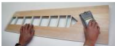
Fig. 2 Sand surfaces smooth