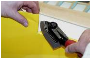
Fig. 12b Fold and bond covering.