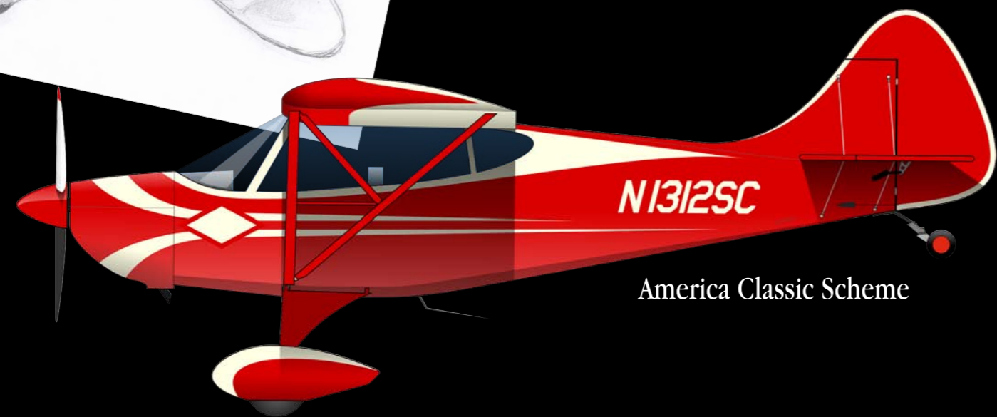
America Classic Scheme